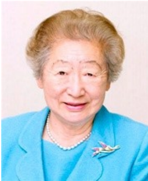
President Sadako Ogata