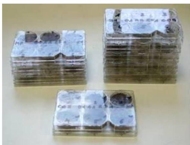
Micro well plates