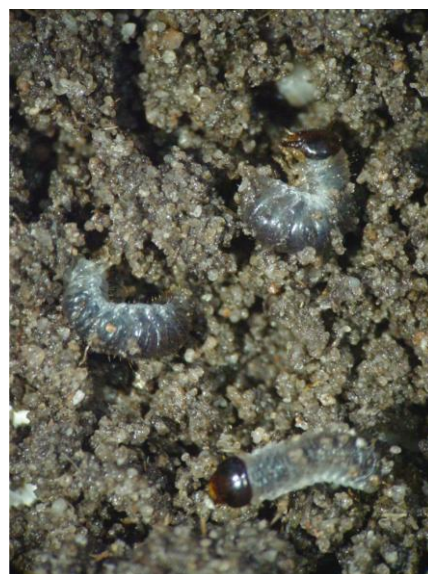
Three larvae of A. constans