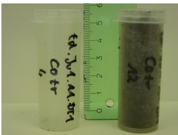
Cell counter tubes