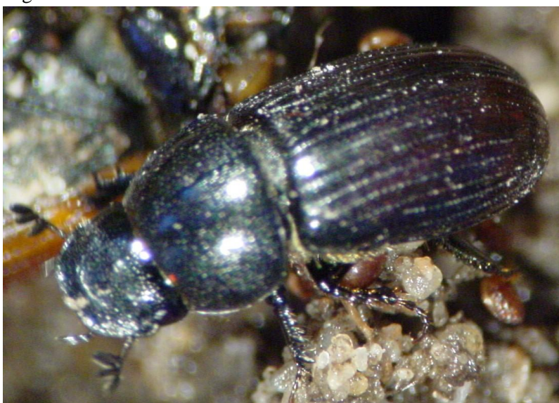
Adult individual of A. constans

20. Alternatively, adult beetles and cow pats can be taken from the field. After transfer to the laboratory the larvae hatching from eggs laid by the adults or by the adults which developed from eggs already in the manure could be used for testing purposes. However, this way is only possible in the period between December and end of April (times valid for Southern France and other parts of Europe) since in this time the beetles are active [24, 25]. Where field-collection of beetles to initiate a culture is conducted, the species identity should be verified using an appropriate key [24]. In fact, in areas like in the hilly region north of Montpellier (France) this species is the dominant dung beetle in winter and early spring (>95% of all individuals found in cattle dung). Colonies initiated from field-collected organisms should be cultured for a minimum of one generation prior to test initiation. The species confirmation, source and history of the organisms should be documented.