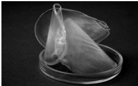
Bioplastic from waste