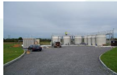
WWT Test- bed facility