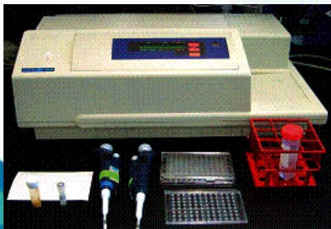
Novel toxicity Testing