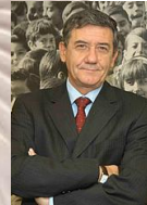
MARTÍN ZILIC, M.D., M.Sc. U. CONCEPCION Former Intendente. Former Education Minister