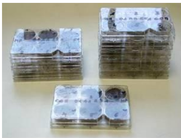
Micro well plates