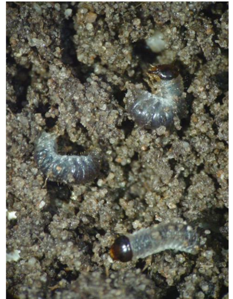
Three larvae of A. constans