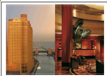
Accommodations - Chicago, IL 2008 OECD Meeting http://www.starwoodmeeting.com/Book/2008OECD

Reservations made after May 28, 2008 will not receive the group rate. (one night's lodging will be charged at time of reservation)