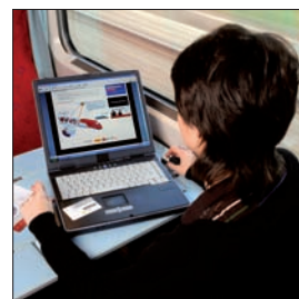
Space and Internet, page 28