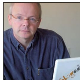
Entrepreneur, page 35