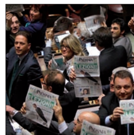
Newspapers on the line? page 24