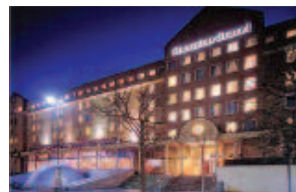
The Sheraton Grand Hotel and Spa, Edinburgh

Edinburgh is home to the award-winning new Scottish Parliament (left), and boasts a rich architectural heritage. An architectural tour of the city would range from the historical New Town , the largest area of Georgian architecture in Europe, to the new Museum of Scotland , the inspiration for which comes from national building traditions with exterior walls clad in golden Clashach sandstone from Morayshire.