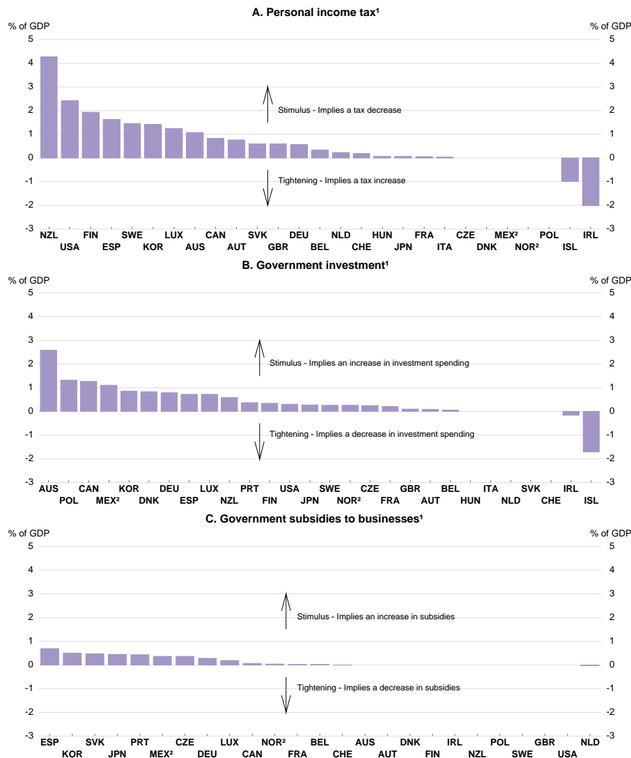
Figure 2. Selected fiscal measures at a glance