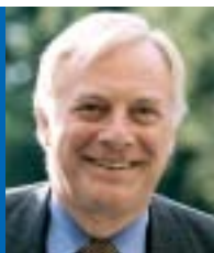
Chris Patten, Commissioner responsible for external relations

Adopted by decision of the European Commission on 6th December 2001, the @lis programme has a budget of € 85 millions of which € 63.5 millions (75%) will be financed by the European Commission, the rest coming from the contributions made by the partners of the programme.