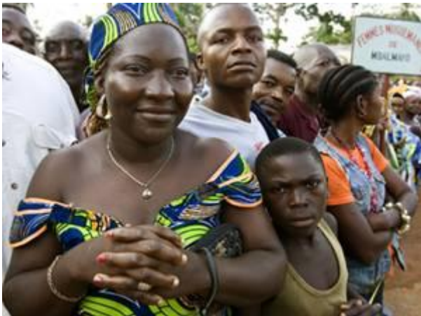
A Cameroonian woman in the town of Mbalmayo. (10 June 2010)