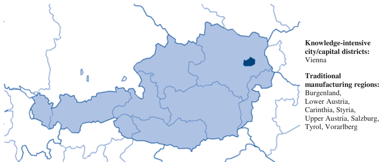
Figure 7.2. Categorisation of OECD regions in country

Note: Colours range from dark to light based on the type of region present in the country with available data. This map is for illustrative purposes and is without prejudice to the status of or sovereignty over any territory covered by this map.