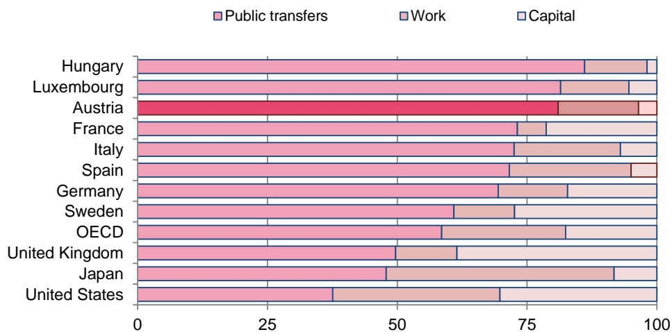
Income sources for older people, late 2000s

Note: Income from work includes both earnings (employment income) and income from self-employment. Capital income includes private pensions as well as income from the returns on non-pension savings.